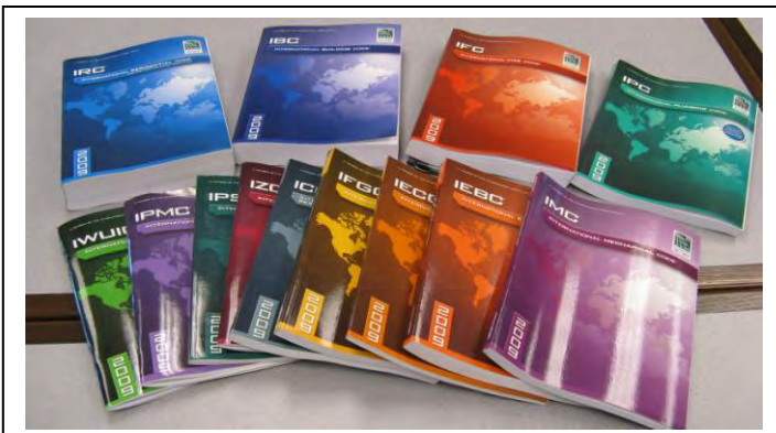
Picture 3: These various books contain the complete contents of the 2009 I-codes. Ten of these code books were adopted by the state Department of Labor and Industry for use in Pennsylvania. Each municipality in the state must have three full sets of those 10 code books at a total cost of $1,593.